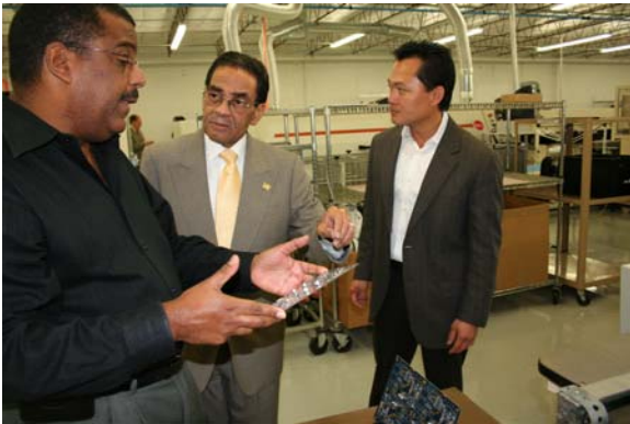
National Circuit Assembly