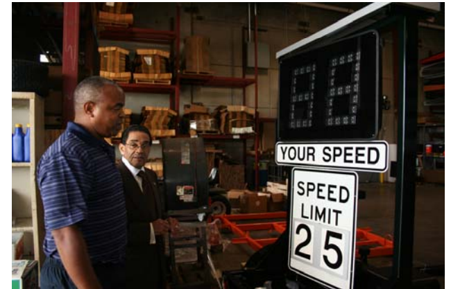
Precision Solar Controls